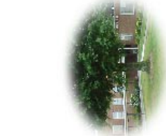
Clearview Elementary School