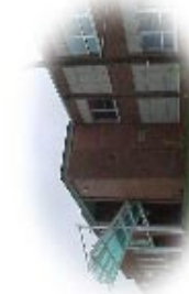
Albert Harris Middle School