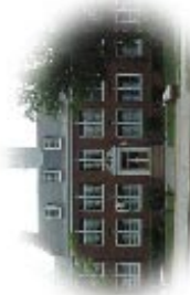
Martinsville Junior High School