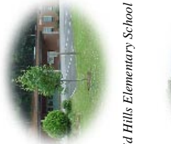
Druid Hills Elementary School